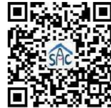
STUDENT ACCOMMODATION COMMITTEE