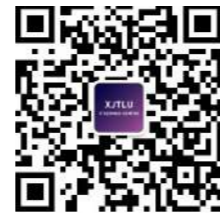
IT SERVICE CENTRE