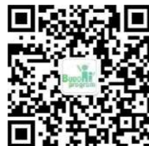
BUDDY PROGRAMME EXECUTIVE COMMITTEE