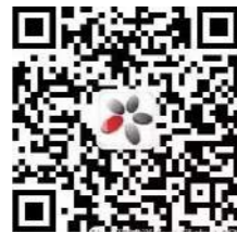
STUDENT COUNSELLING CENTRE