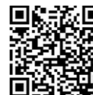
西浦学生事务办公室微博