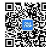
XJTLU One-Stop Student Service Centre