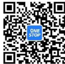
XJTLU ONE-STOP STUDENT SERVICE CENTRE