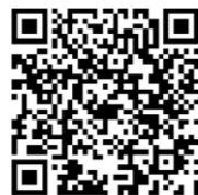
Freshmen Quick Start Guide