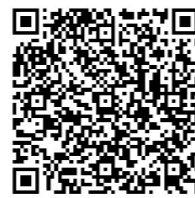
Student Development Advisor