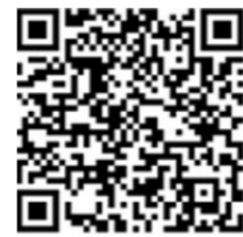
XJTLU CLUB HOME

THE FIRST STEP TOWARDS SUCCESS IS KNOWING HOW TO OBTAIN RESOURCES AND SUPPORTS INITIATIVELY.