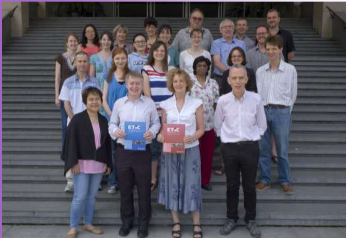
The ETiC Editorial Team

Please email submissions to etic@xjtlu.edu.cn . Author guidelines and past issues are available on our web site: http://etic.xjtlu.edu.cn . Please try to follow the guidelines as closely as possible. The deadline for submissions is 30 th April, 2014.