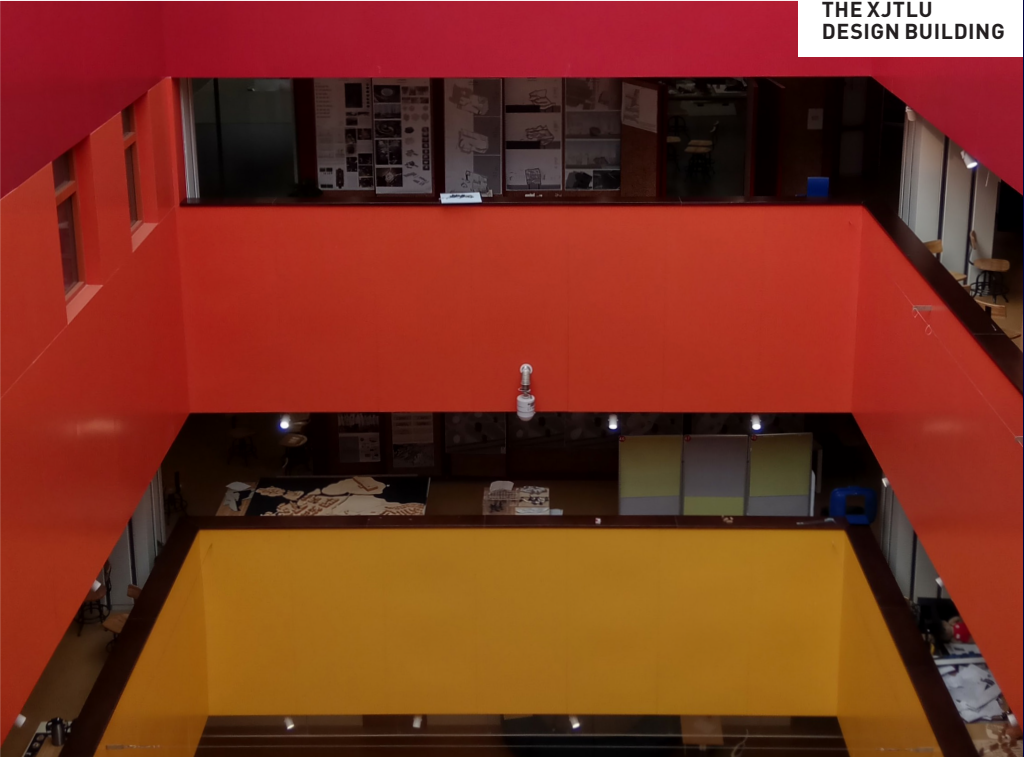
THE XJTLU DESIGN BUILDING