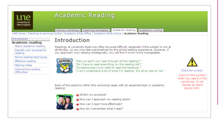
▲ Figure 1.: Home page of the Academic Reading section

Each of the three sections has an introduction that includes student perceptions of common problems and areas of concern. This has the effect of helping users feel more comfortable seeking additional support. Each section also has a drop-down menu with a list of choices, and each separate workshop has an outline of the session aims, which is helpful in deciding how it will be beneficial to the user.