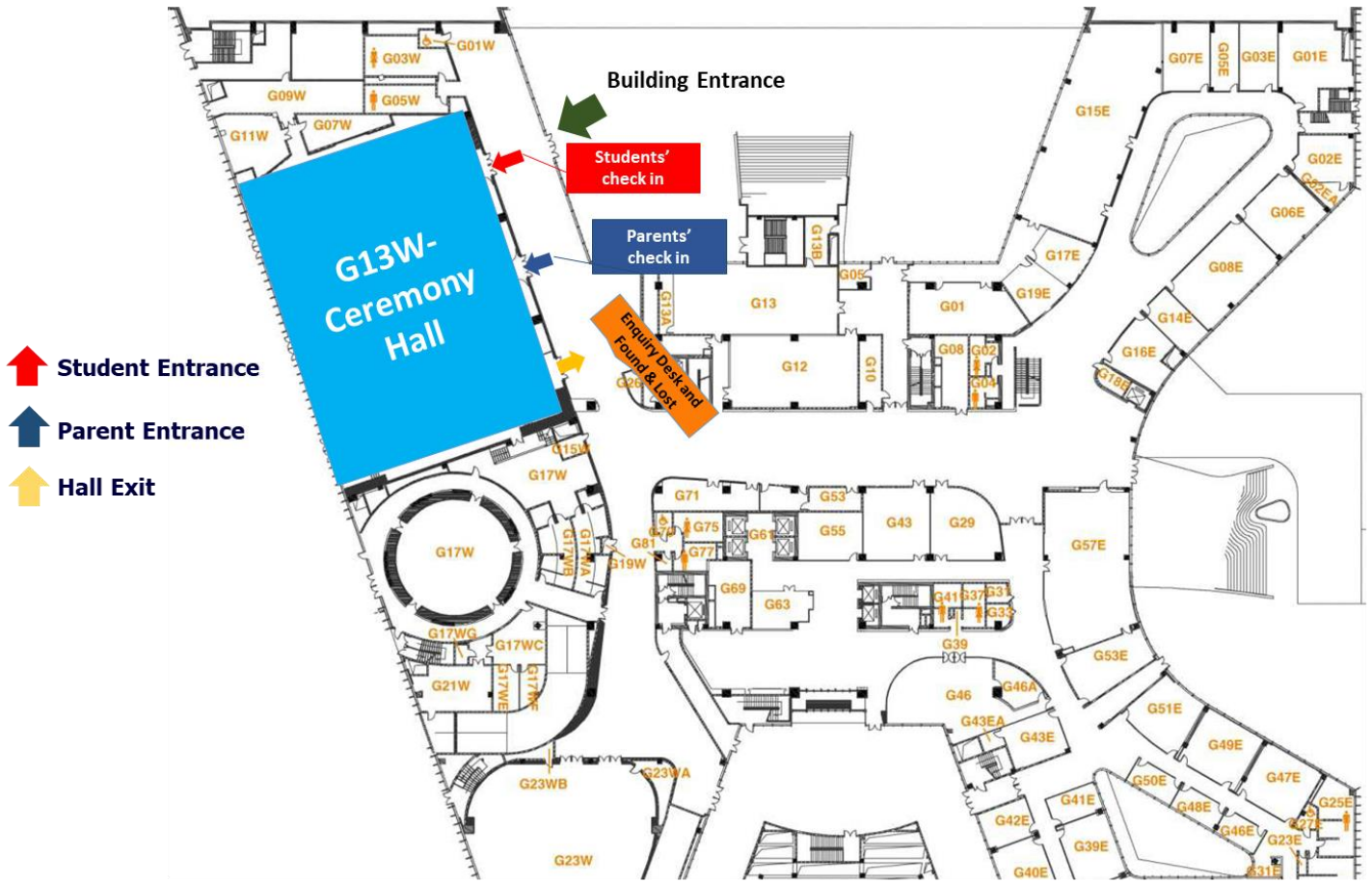
Guide Map 2/2