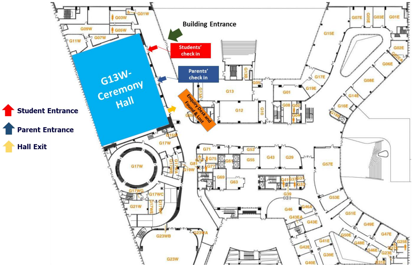
Guide Map 2/2