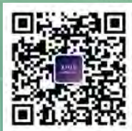
Learning Mall Wechat Official Account