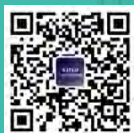
IT Service Centre WeChat

Service Hours: 9:00-12:00, 13:00-17:00 on weekdays