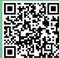
Learning Mall Homepage